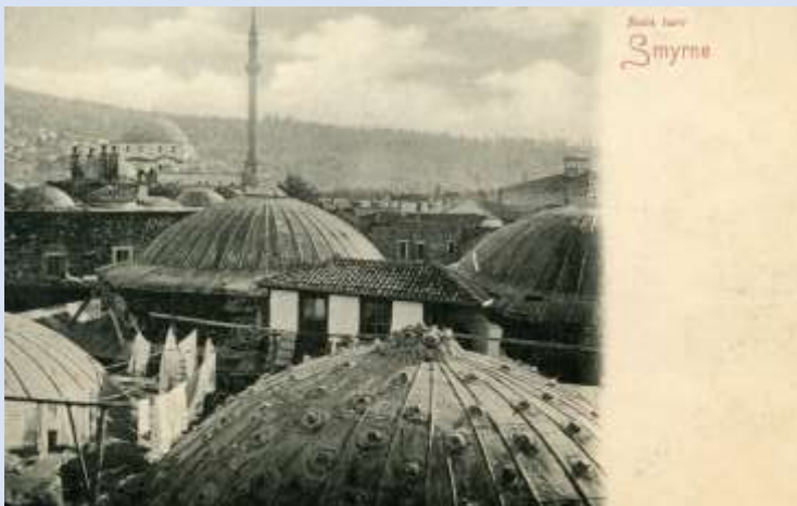
Hanging towels between domes of a hammam in Smyrna, postcard, early 20 th century,