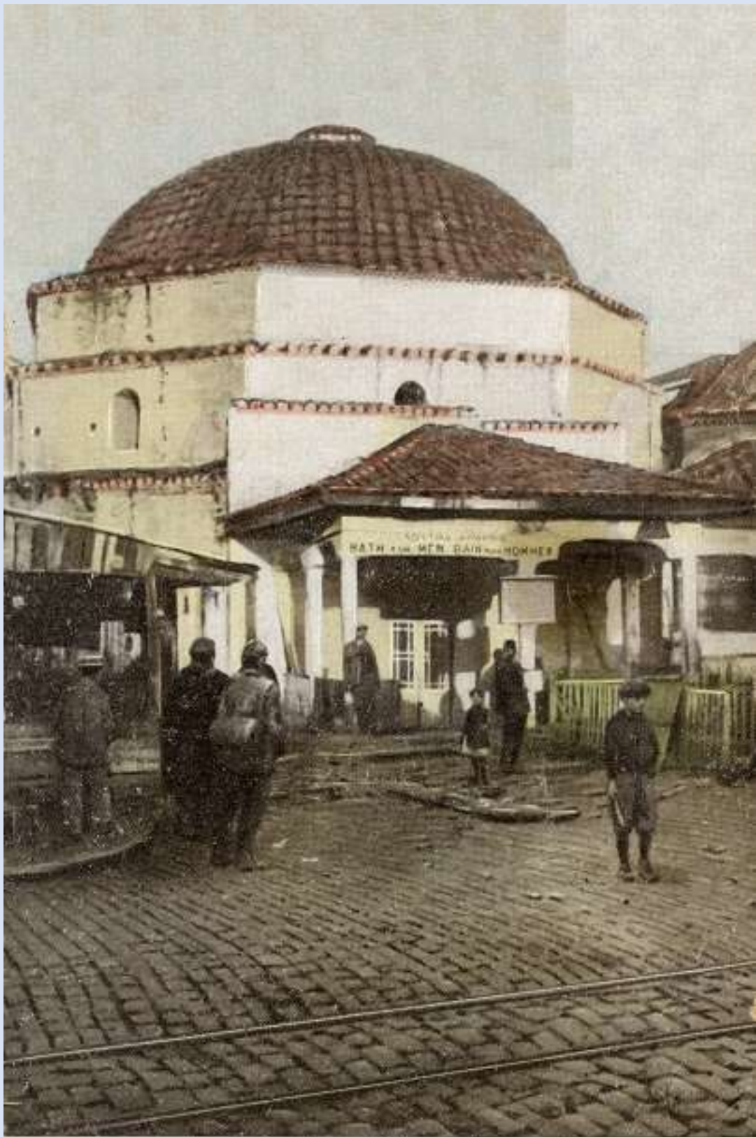
1028 Θεσσαλονίκη - Τουρκικά Λουτρά Salonique (Grèce) — Bains Tures

The Murad II Hammam in Thessaloniki, colored postcard, early 20 th century, © The D. Loupis Visual Collection of Islamic Architecture