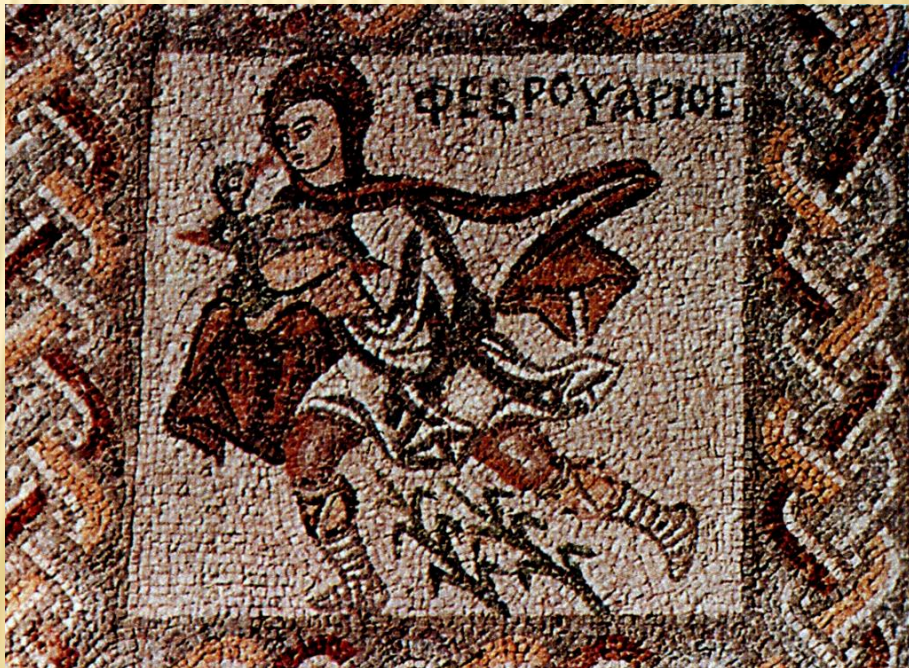
Part of the mosaic floor in an early Byzantine building. Thebes. 6th cent. AD